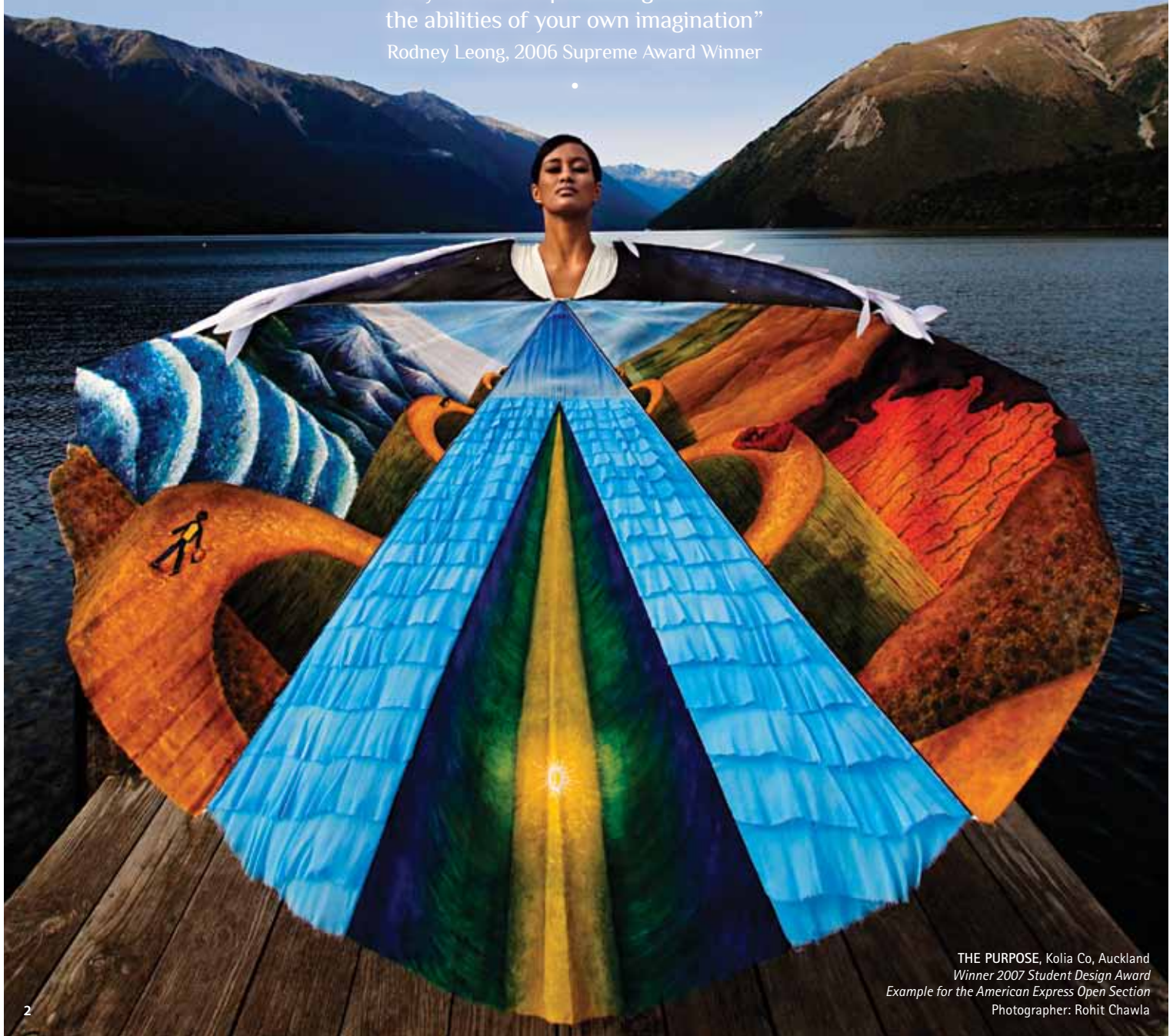
THE PURPOSE, Kolia Co, Auckland Winner 2007 Student Design Award Example for the American Express Open Section

• “There are no expectations of what you should create when entering WOW® only the aim of personal growth and the abilities of your own imagination” Rodney Leong, 2006 Supreme Award Winner •