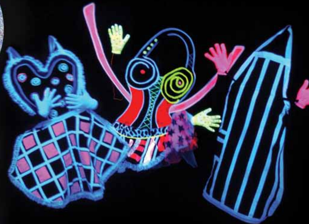
PSYCHEDELIC THUNDER, Sam Laidlaw, Nelson The garment headpiece creates a unique sound as the model moves on stage